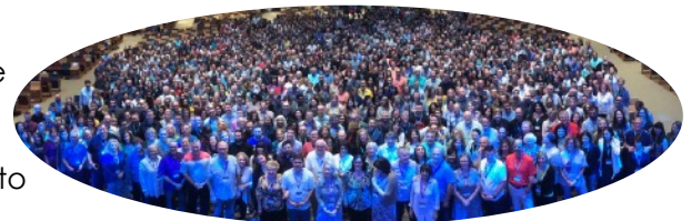
Together 2019 group photo

Please pray for the 1,500 adult missionaries and the 700 missionary kids that attended. We need God's provision everyday as we serve the Lord in various areas of the world.