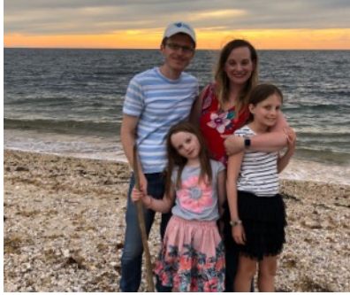
Downtime at the beach (↑) and riding a camel at the Creation Museum (↓)