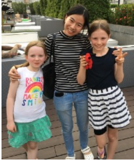
Our Thai Christian friend (↑) and the girls' first Bangkok tuk-tuk ride (↓)